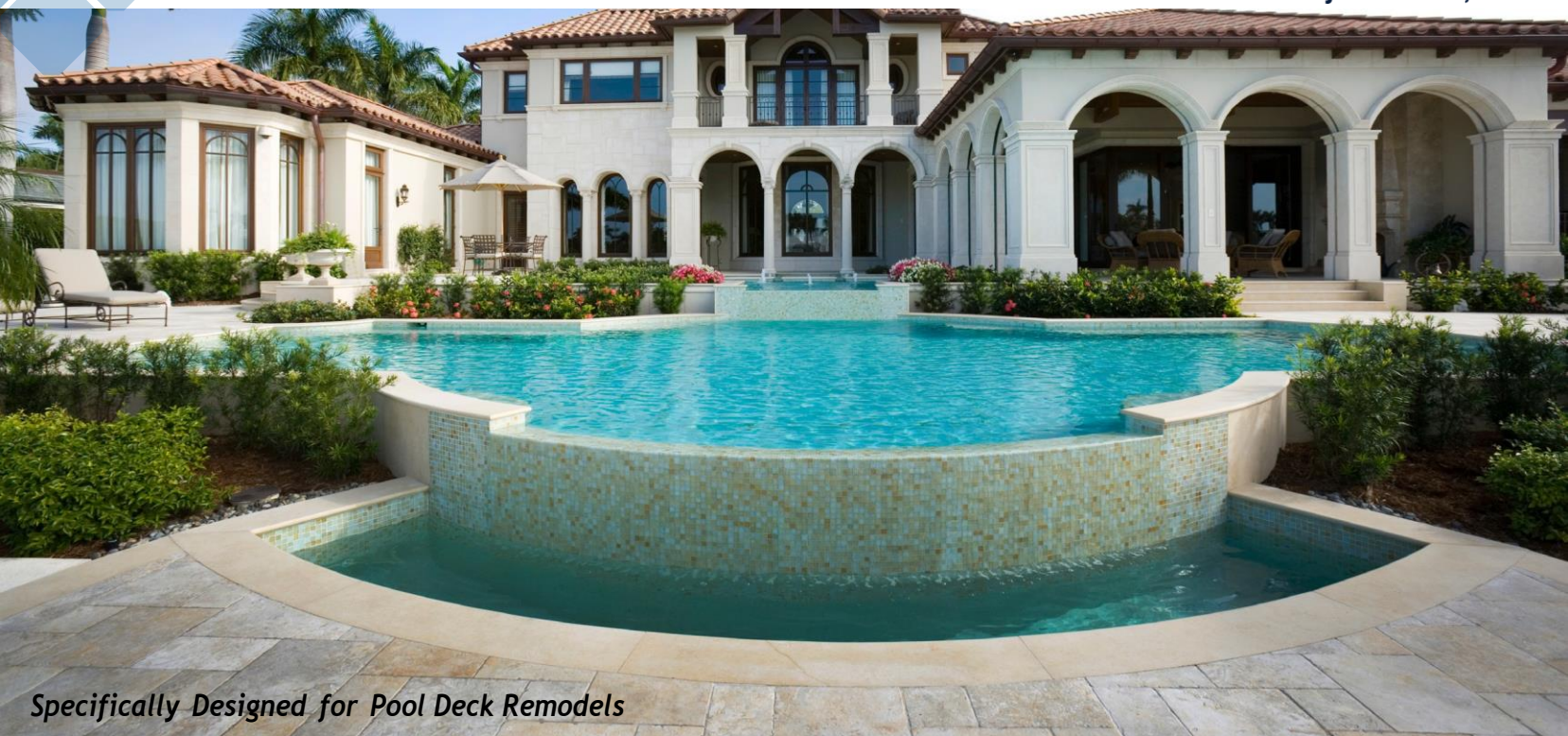
Specifically Designed for Pool Deck Remodels